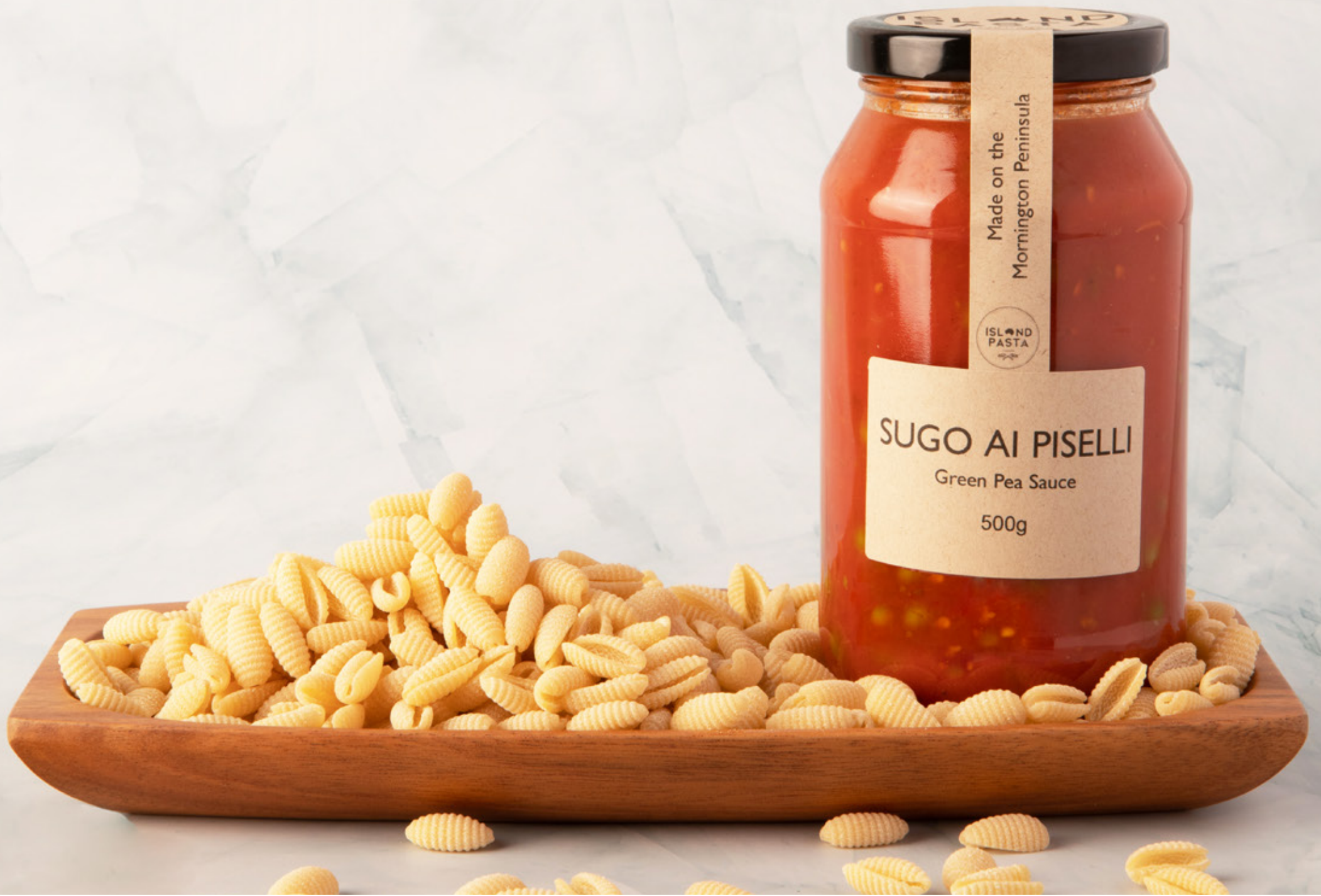
SUGO AI PISELLI (With Green Peas And Caramalised Onions)