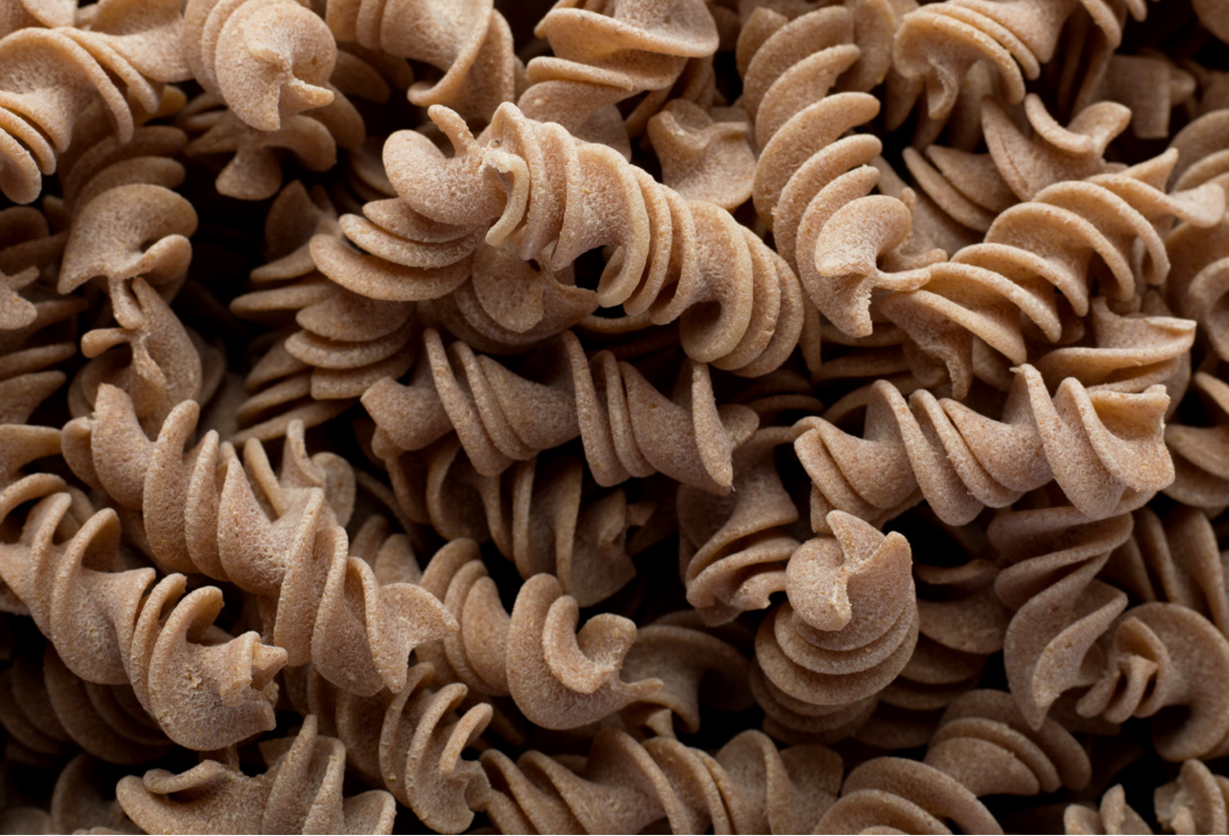
ORGANIC SPELT FUSILLI