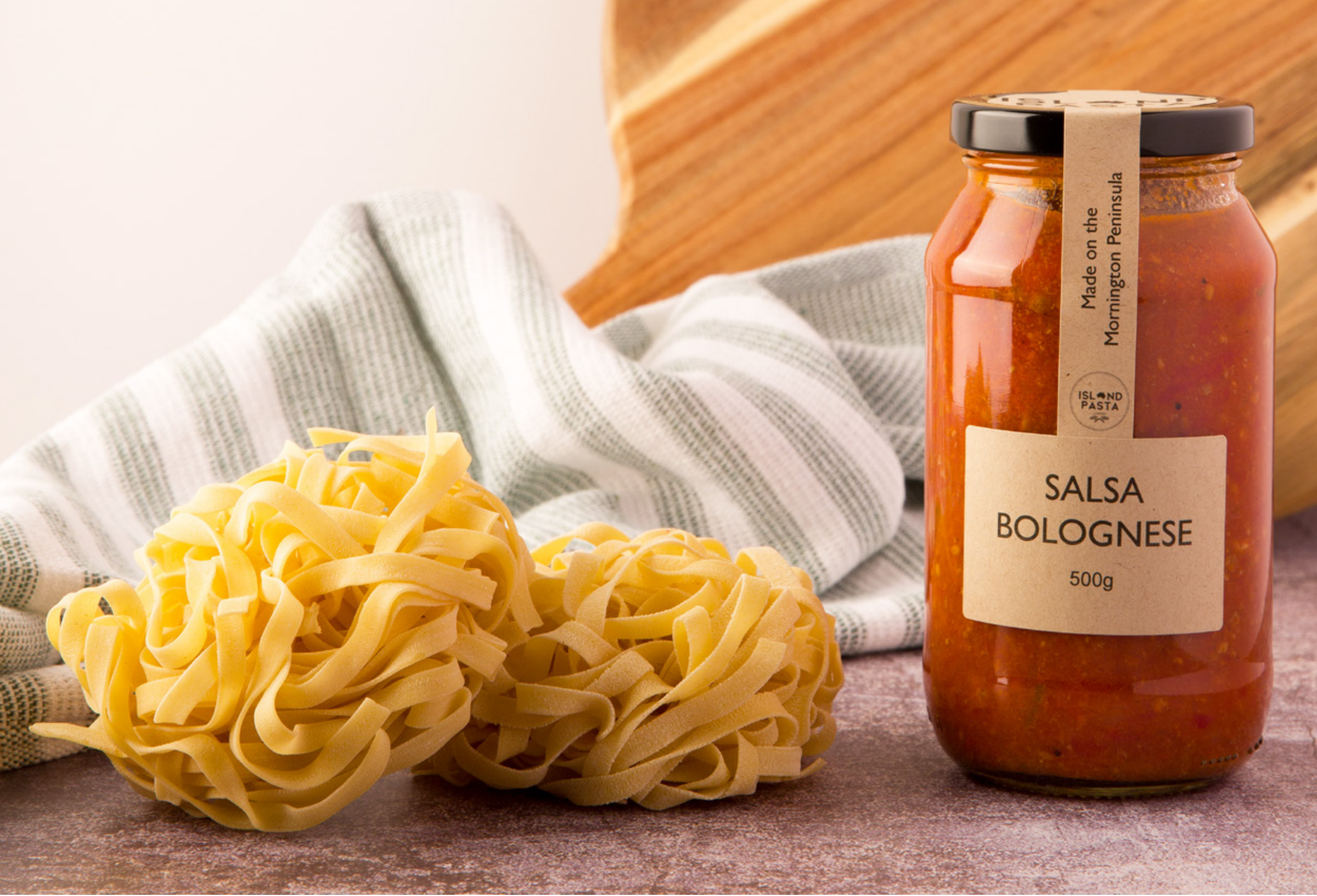
SALSA BOLOGNESE (With Grass Fed Beef And Pork Mince)