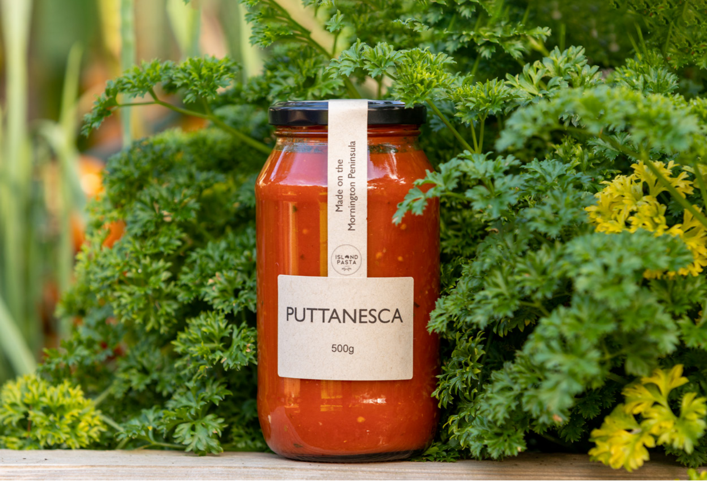
PUTTANESCA (With Anchovies And Olives)