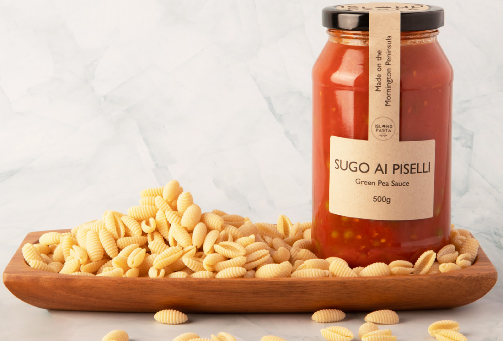
SUGO AI PISELLI (With Green Peas And Caramalised Onions)