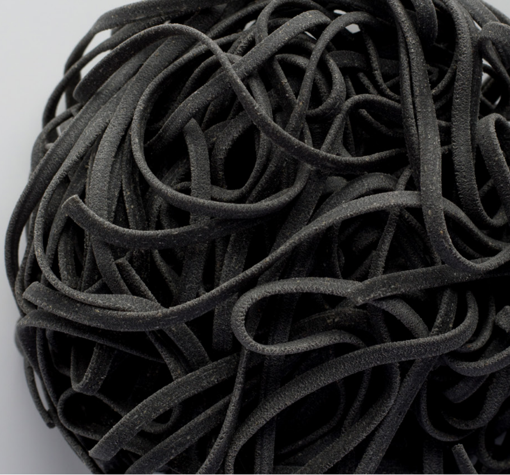
SQUID INK TAGLIOLINI