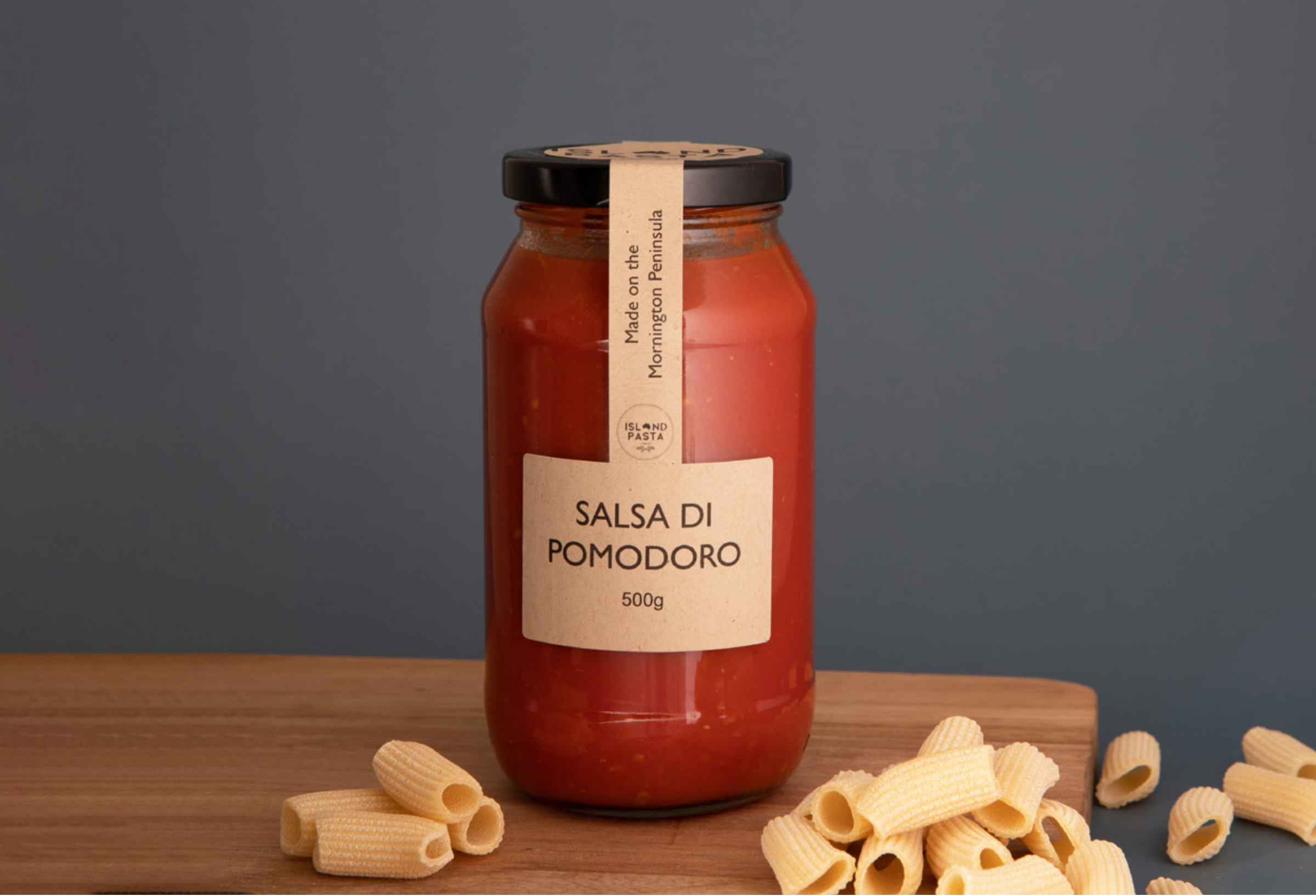
SALSA DI POMODORO