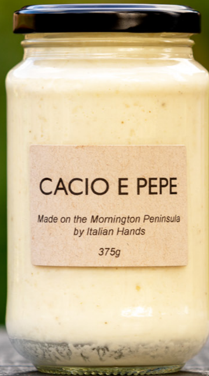
CACIO E PEPE (Literally "Cheese and Pepper")